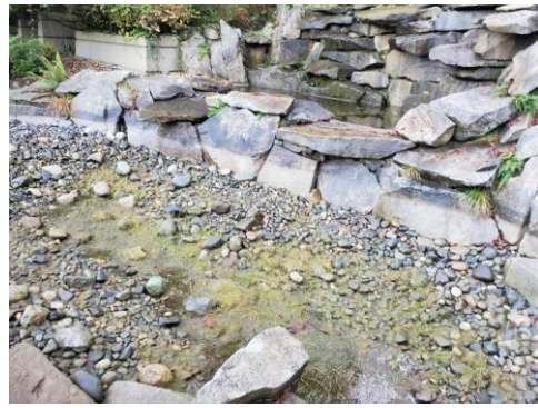
Upper pond full and large pond empty